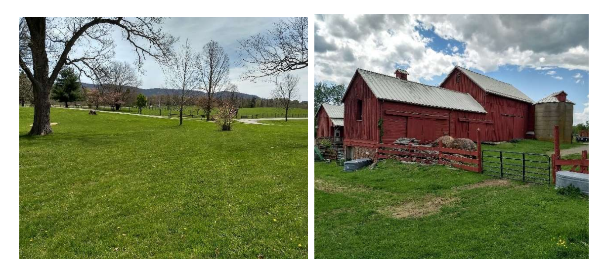
Stony Kill Farm and Barns

The Town of Fishkill 2009 Comprehensive Plan recommended consideration of a "Recreation Zoning District (see Map 2 in the 2009 Plan) to protect large, significant open space parcels. This was not implemented. Some communities have adopted "Conservation Zoning Districts" for these types of properties, in which appropriate, low impacting uses are permitted which are consistent with the features and character of these sites and to accommodate current uses on those sites. Examples would include Stony Kill Environmental Education Center and Hudson Highlands State Park Preserve, among others, as recommended in Goal B, Objective 2 of the draft CPU in the Large Parcel Analysis. It is recommended that the Town Board consider the possibility of adopting a new Conservation Zoning District and rezoning appropriate parcels (shown on Map 2 of the CPU into that new Zone).