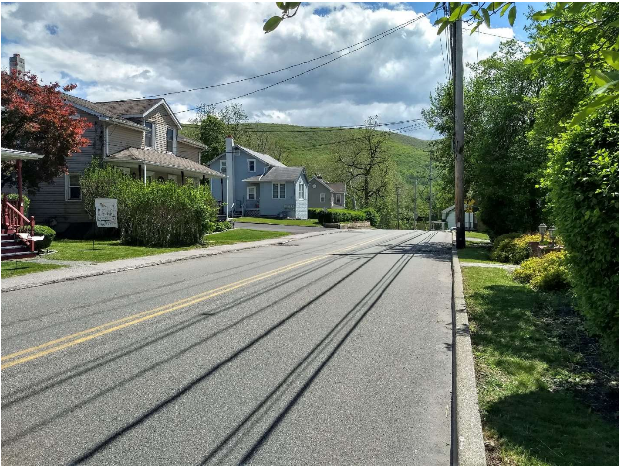
Historic Residential neighborhood, Glenham

Zoning provisions are in place for residential site design at section 150-153. These standards encourage home siting that does not detract from scenic views; emphasize pleasant, walkable neighborhoods; underground utilities; porches facing streets, and avoiding garages as prominent features; preserving existing ridgelines, vegetation, farm roads, country lanes and other aspects of the rural landscape.