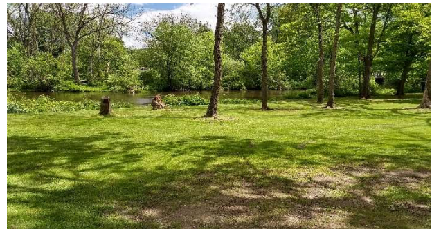
Jean Van Pelt Park on Fishkill Creek