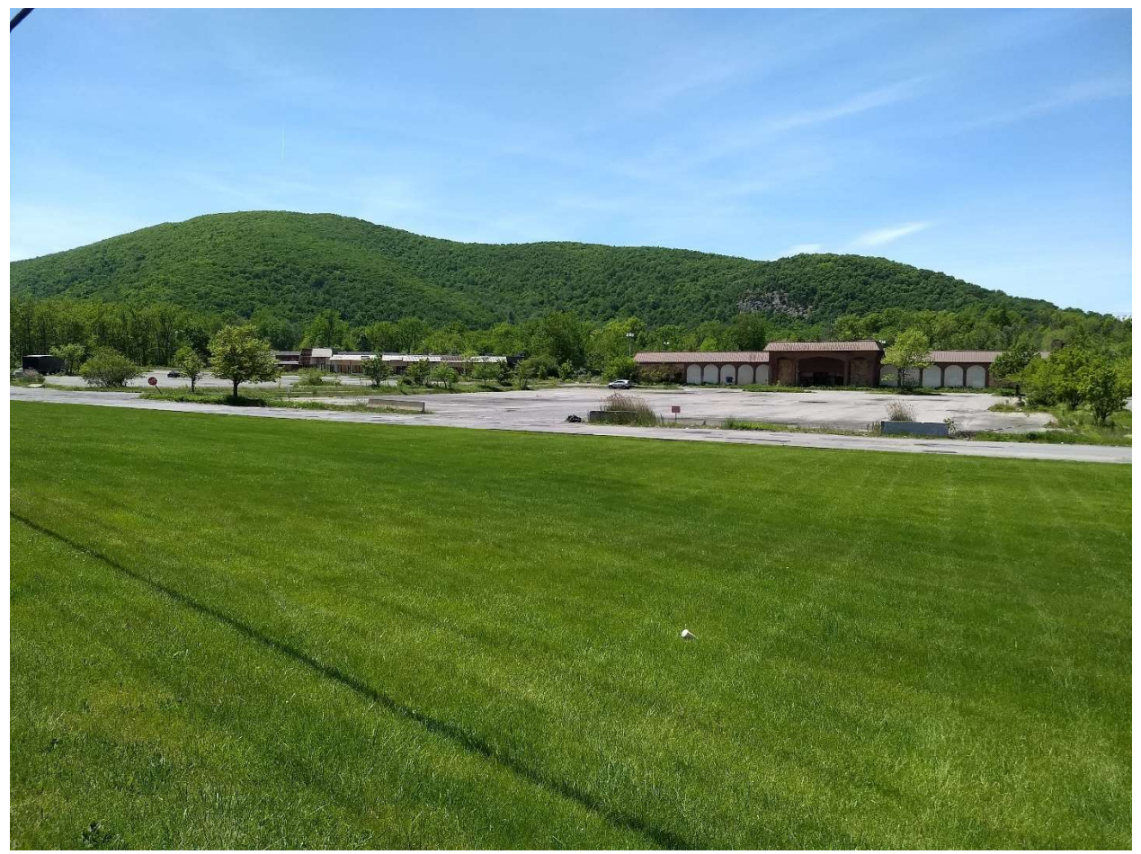
Former Dutchess Mall site on Route 9, south of Interstate Route 84

Consider requiring fiber optic cable for internet and EV stations in new or redeveloped nonresidential sites.