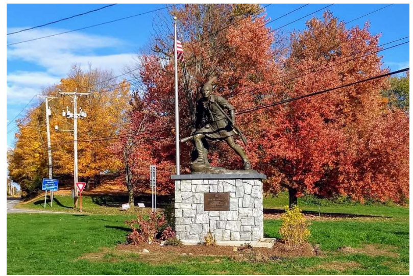
Statue of Daniel Nimham, at intersection of Routes 52 and 82

a. Prepare a full inventory of historic sites and structures in the Town of Fishkill and follow up with additional recommendations (e.g., nominate qualifying sites/structures for NYS and National Registers of Historic Places).