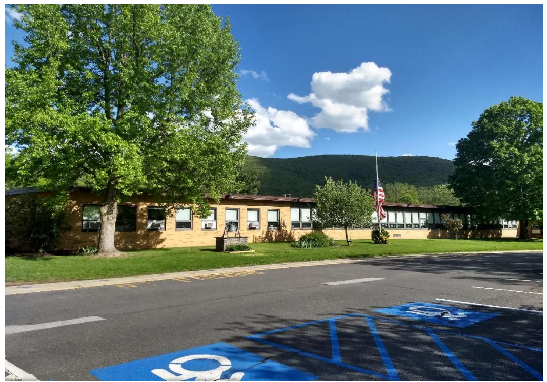
Glenham Elementary School