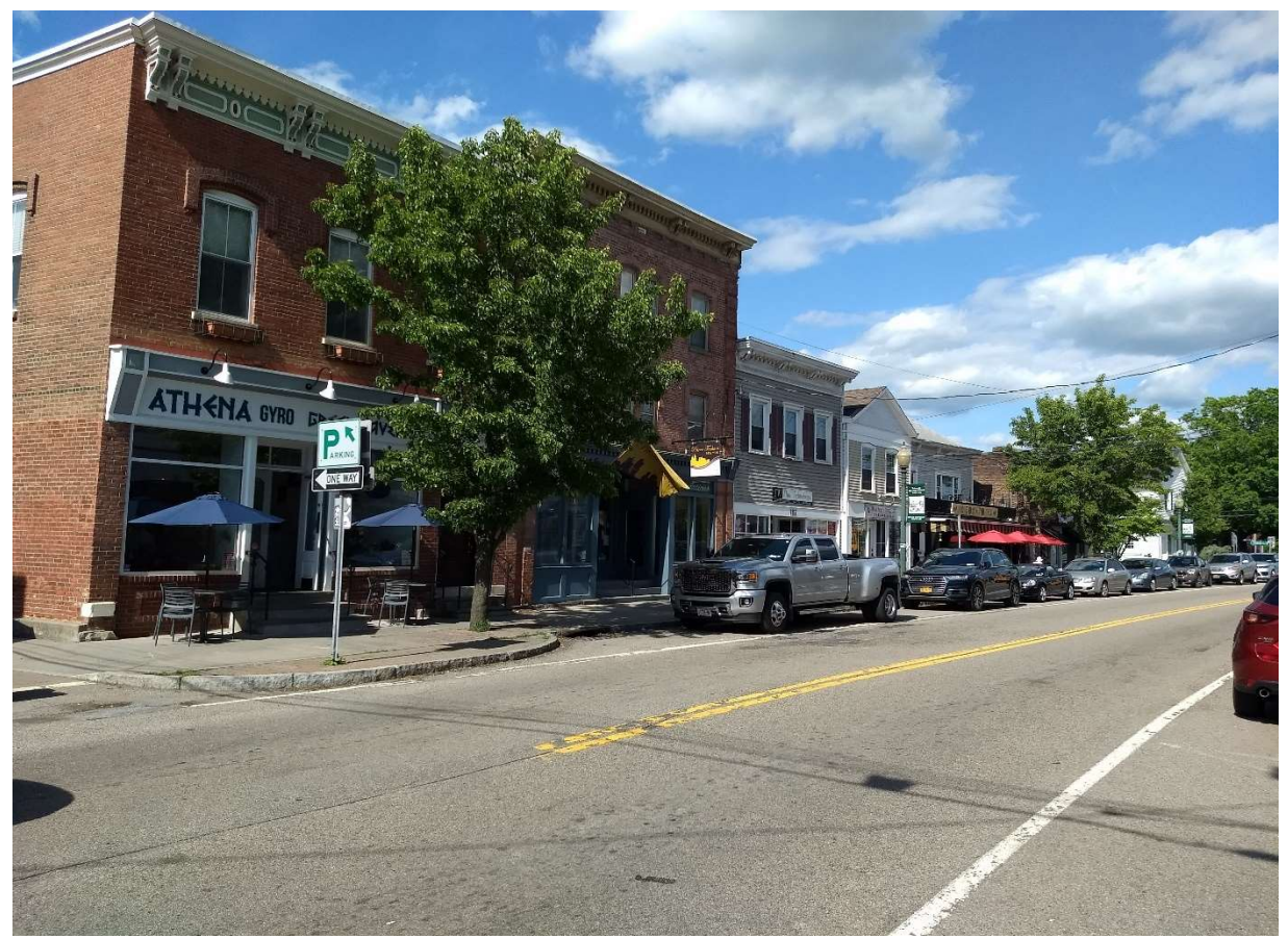
Classic example of mixed uses, compact design, and a walkable neighborhood, with transportation choices.

B. GOAL: PROMOTE GOOD DESIGN OF THE BUILT ENVIRONMENT to foster a distinctive, attractive community and stimulate continued private investment for private and municipal projects in the Town. The Town of Fishkill Comprehensive Plan adopted in June of 2009 emphasized the concept of "Smart Growth" stating the principles on page 6 of the plan as follows: "#1. Mix land uses; #2. Take advantage of compact building design; #3. Create a range of housing opportunities and choices; #4. Create walkable neighborhoods; #5. Foster distinctive, attractive communities with a strong sense of place; #6. Preserve open space, farmland, natural beauty, and critical environmental areas; #7. Strengthen and direct development towards existing communities; #8. Provide a variety of transportation choices; #9. Make development decisions predictable, fair and cost-effective. #10. Encourage community and stakeholder participation in development decisions." The Town of Fishkill later amended certain chapters of the Code of the Town of Fishkill, primarily Chapter 132 Subdivision of Land and Chapter 150 Zoning, to incorporate the Dutchess County Greenway Guides, including smart growth concepts.