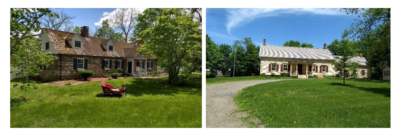
Hendrik Kip House, Old Glenham Road & Van Wyck Homestead Museum, Route 9

b. Allow adaptive re-use of historic structures to help preserve them by permitting a broader range of uses than would be allowed in current zoning (e.g., bed and breakfast, tourist or guest house, limited office use, etc.).