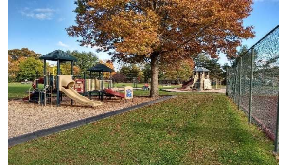
Maurer Geering Park playground