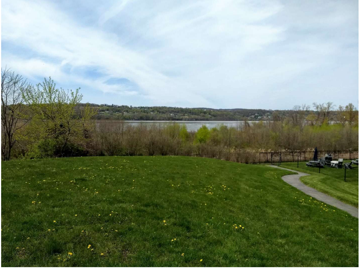
Hudson River Waterfront, Brockway Road